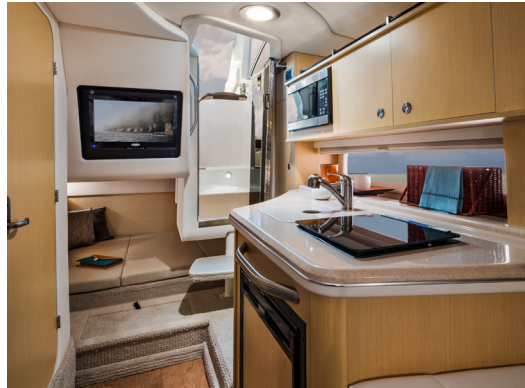
No other manufacturer emphasizes the craft of decor quite like Sea Ray. The 280's solid-surfaced countertops, multi-tone vinyl and gleaming fiberglass finishes pop under multiple skylights and hullside windows.