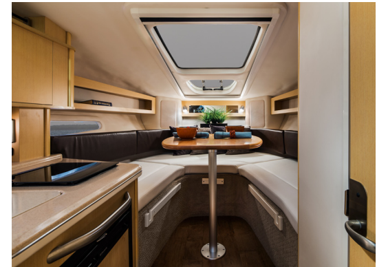
The 280's naturally lit cabin is as inviting as the view from above. Foredeck skylights and extended hullside windows throughout the cabin flood the V-berth and galley with natural light.

ABYC Sponsor of ABYC Marine Certification School