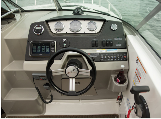
The ergonomically designed helm has clear sight lines and puts all the controls within reach.

Funny how we can work ourselves up chasing a moment of relaxation. But kicking back doesn't have to be hard. All it really takes is a couple calls, a few friends, and the 280 Sundancer. Experience pure peace on the sport cruiser equipped for relaxation. The convertible lounges, plush seats and comfortable berth transition social time to quiet time, so no matter where you are on the water, you're in the right place and the right mindset.