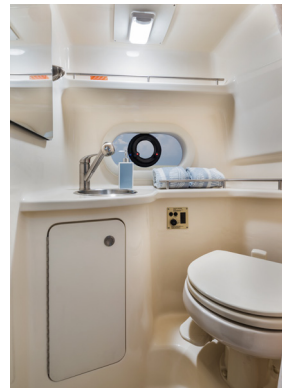
There is nothing like the comfort of home out on the water. That's why Sea Ray makes the VacuFlush™ on the 280 standard. The fiberglass enclosed head features a finished vanity with a mirror and countertop.