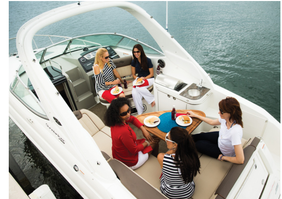
From the curved portside L-shaped lounge to the large fold-down sunpad, everyone onboard the 280 can spread out and soak up the sun. Nifty underseat storage stows away all your gear.