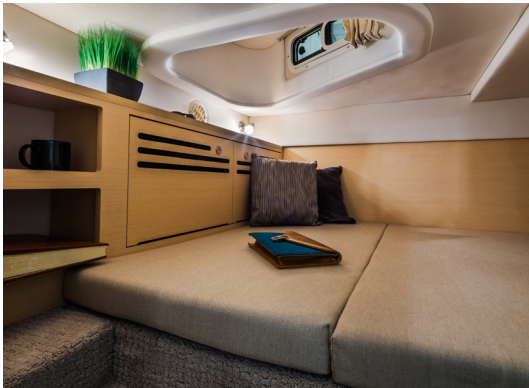
Whether you're traveling to a weekend destination or need a moment of quiet, the 280's mid-berth creates an inviting getaway. Experience total peace on the berth's memory-foam mattress.